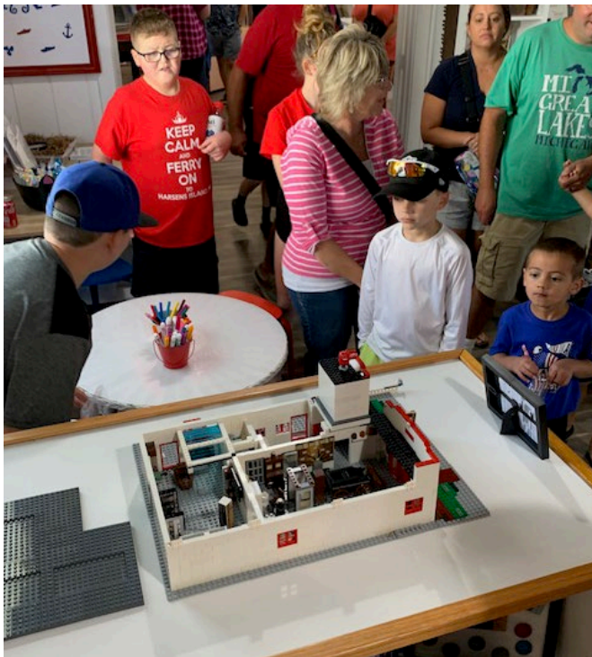
Left: Lego replica of Historical Museum