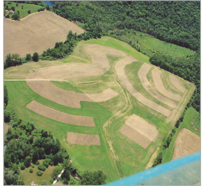
Aerial view photo courtesy of Perry Gardner

The second project redesigned the layout of our fields to create strips that align with the topography of the hill so that the steeper slopes will grow our perennial crop— grass, while the more level ground will be used to grow our annual crop-corn. This will help reduce soil erosion and runoff as well as reduce our carbon footprint. Both practices meet a conservation goal of improved soil health. The aerial picture taken the week of 6/4, the grass seed has germinated and the corn was not yet visible.