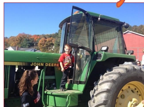
Farm guest on tractor at Laurelbrook Farm