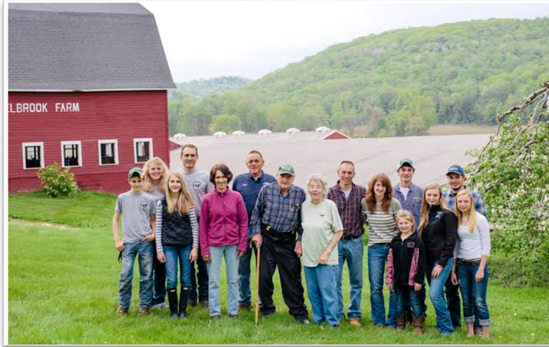
Members of the family from L to R: