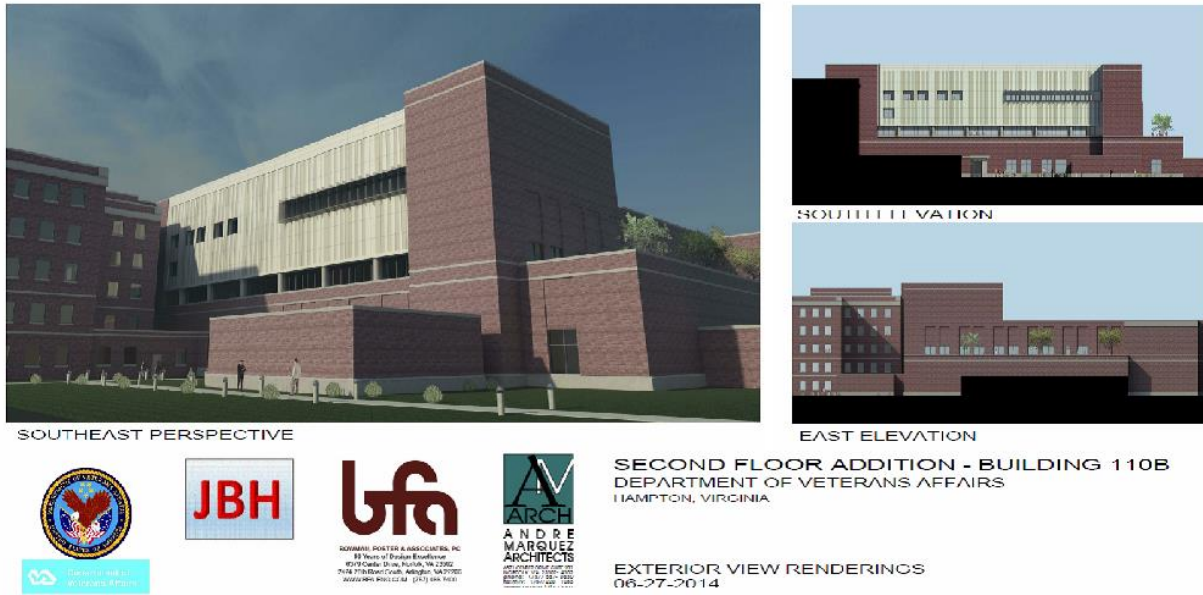
Figure 1 Architecture & Engineering Project