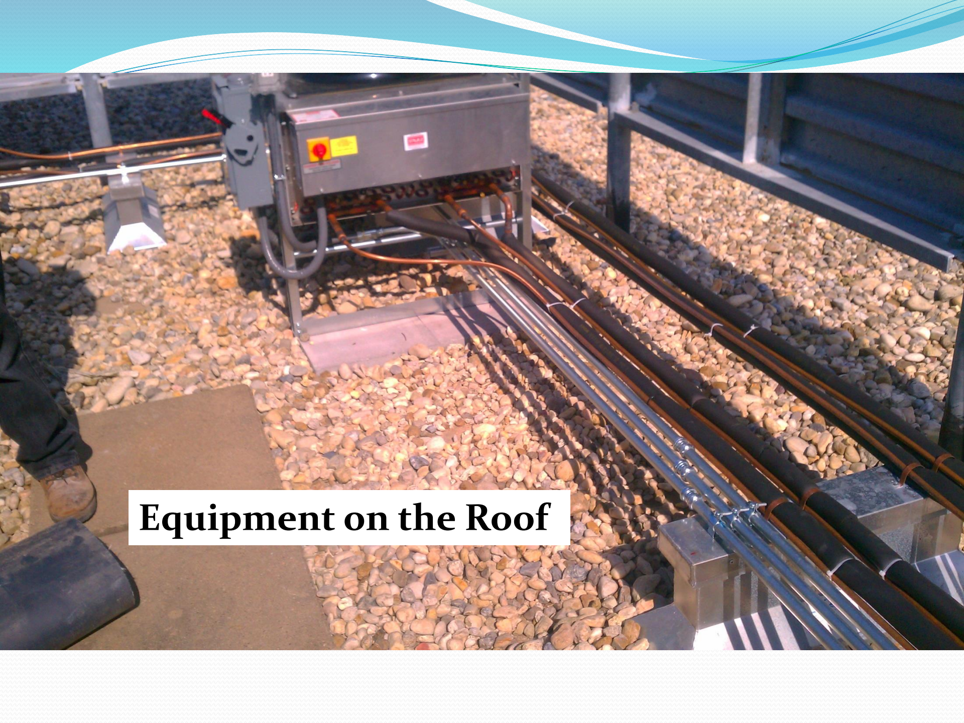
Equipment on the Roof