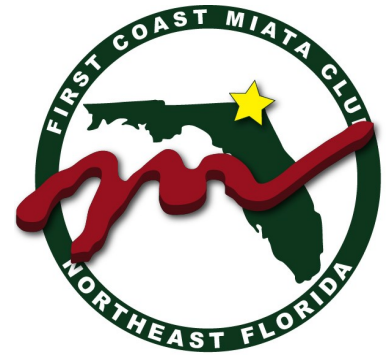
A MONTHLY PUBICATION FOR THE MEMBERS & FRIENDS OF THE FIRST COAST MIATA CLUB