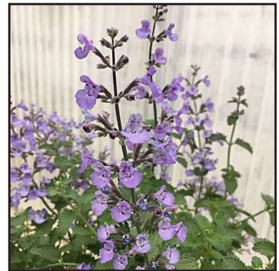
Nepeta Sylvester Blue