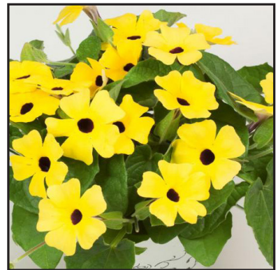
Yellow Dark Eye