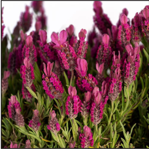
Pretty In Pink Spanish