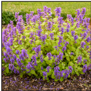
Nepeta Chartreuse On The