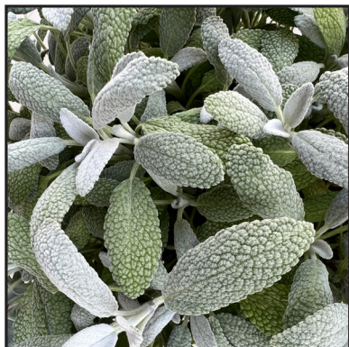
Salvia Snow Flake