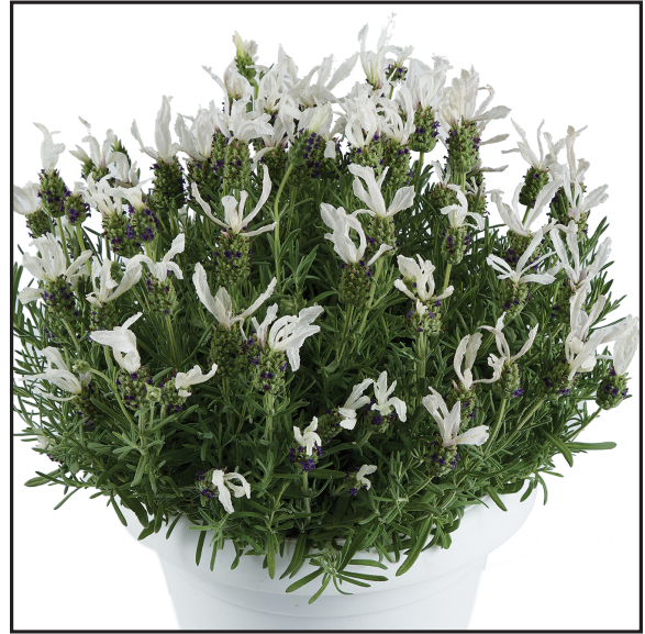
White Frost Spanish