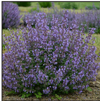
Nepeta Kitten Around