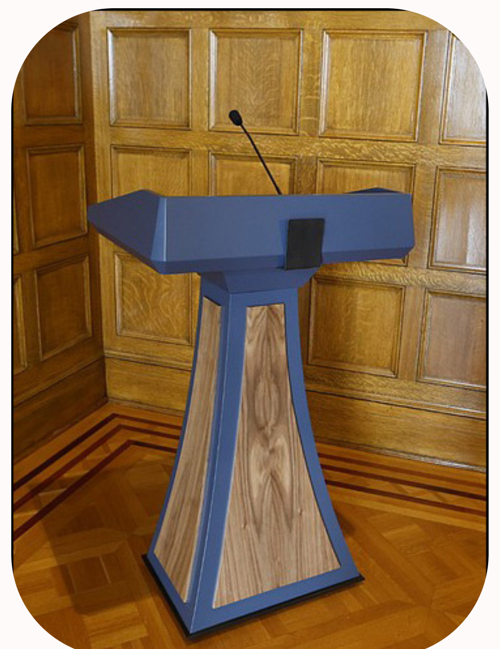
ACTUAL Photo of the Podium