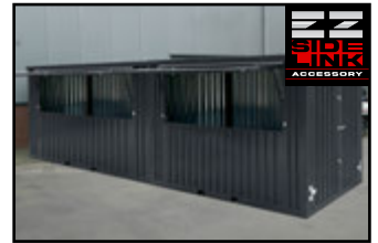
EZ LINK ACCESSORY