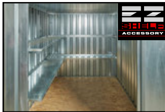
EZ SHELVES ACCESSORY