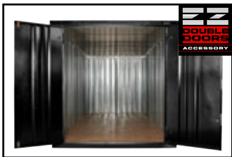
DOUBLE DOORS ACCESSORY