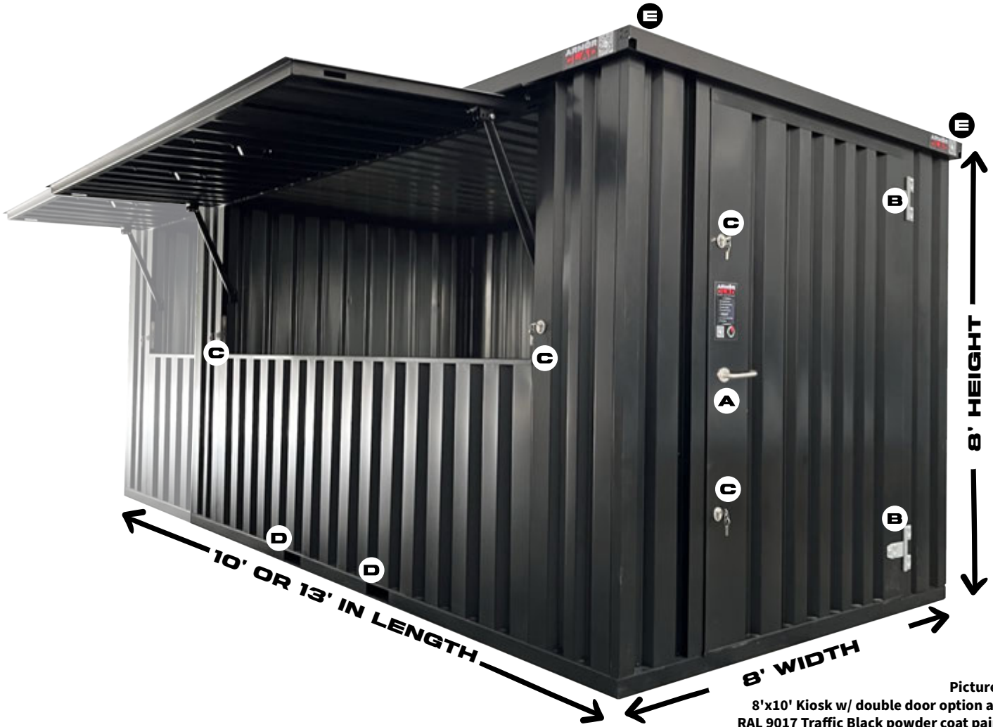
Pictured: 8'x10' Kiosk w/ double door option and RAL 9017 Traffic Black powder coat paint.