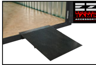
ACCESS RAMP ACCESSORY