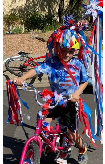
Thanks to all our neighbors who joined the fun!