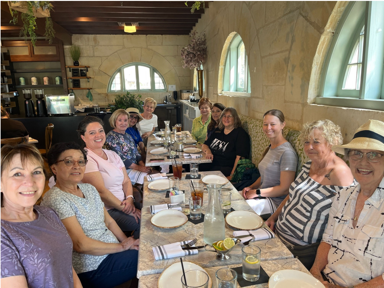
The Ladies lunching at Jardin's after visiting the Botanical Gardens last month

Here is a quick run down of events for the ladies group. Please note that JULY and SEPTEMBER have adjusted calendar dates other than the normal 2nd Friday of the month.