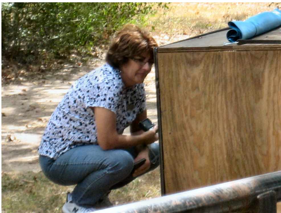
Hey, I'm not reaching in there for those eggs! (2008 at the Faulkner farm.)