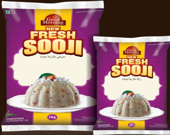
New Fresh Sooji न्यू फ्रेश सुजी