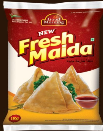
New Fresh Maida न्यु फ्रेश मैदा