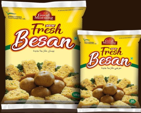
New Fresh Besan न्यू फ्रेश बेसन