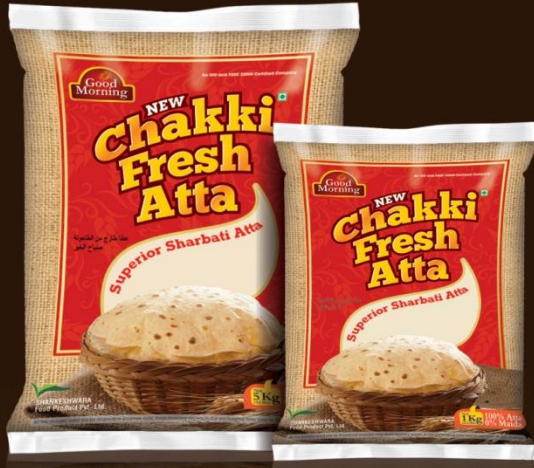
New Chakki Fresh Atta न्यू चक्की फ्रेश आटा