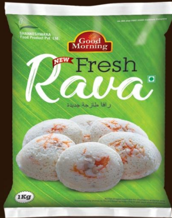
New Fresh Rava न्यु फ्रेश रवा