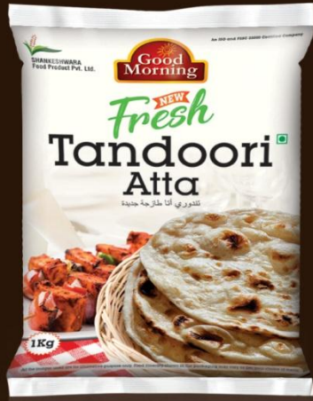
New Fresh Tandoori Atta न्यू फ्रेश तंदुरी आटा