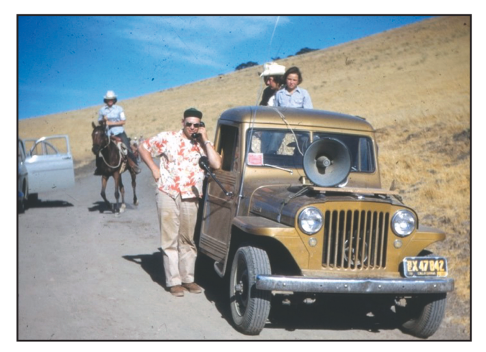
Photo D. One of the club activities I remember best was the annual Mt. Diablo horseback trek. Hams would take old Jeeps up along the trails to provide direction and safety for hundreds of horseback riders. We used 6-meter AM Civil Defense Gonset Communicators.

A good friend of mine — another young ham — and I used to hang out together on the bands and in person. His father worked as an engineer for Voice of America. One quiet evening, he invited me for a personal tour of the station with his dad, which I jumped at. We drove to the site and his dad walked us through the power supply room, a 500-square-foot room full of huge capacitors, transformers, and solid copper straps to tie it all together, and DANGER signs everywhere. And then the room where the finals were kept. Some of these final tubes were large enough to climb inside. It all seemed to be just a massive copy of my Heathkit SB-200 amplifier.