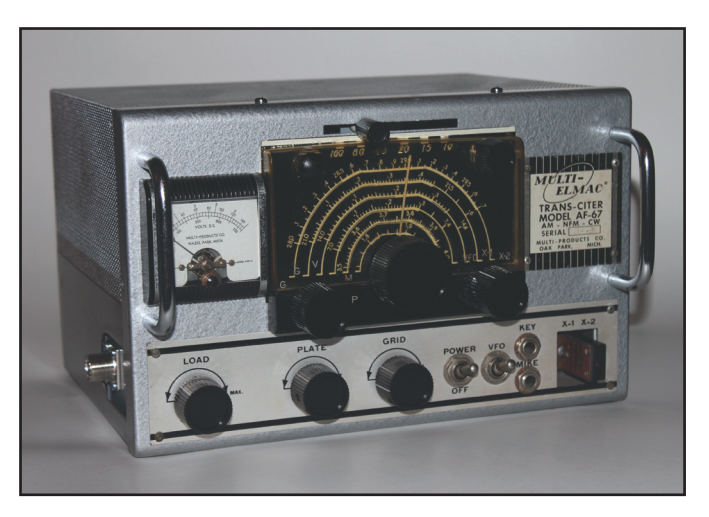
Photo A. My dad's transmitter back in the 1950s was a Multi-Elmac AF-67, just like the one shown here from SM2CEW's website <http://sm2cew.com/multielmac.html>. It was joined by a Hallicrafters S-40B receiver.

The FCC examiner in San Francisco was a cranky older man and he smoked a big cigar. And when he spoke to all of us, it just sounded like a barking dog. We were on the second floor of the FCC office at 555 Battery Street with the room