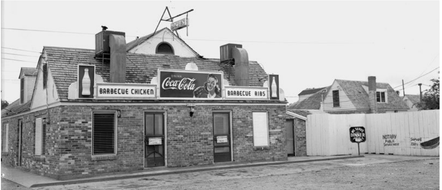
Dave's Bar-B-Q restaurant in Elm Thicket, circa 1946.