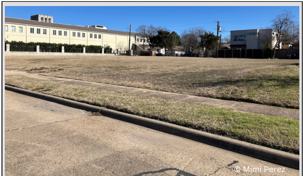
Pictured: Empty lots where 8 duplex homes once stood and are now magnets for crime activity. Plans presented show the 2 southern lots to remain undeveloped and possibly used for further building expansion.