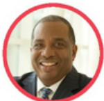
Texas State Senator Royce West