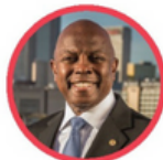
Dallas Mayor Pro Tem Tennell Atkins