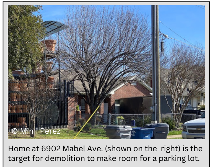
Home at 6902 Mabel Ave. (shown on the right) is the target for demolition to make room for a parking lot.

As of now, no paperwork has been filed with the city to request a zoning change.