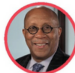
U.S. Trade Representative Ron Kirk