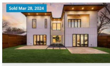
$1,350,000 5 bd • 4 ba • 4,018 sqft 4603 Newmore Avenue, Dallas, TX 75209