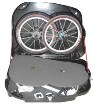
12. Middle foam covered