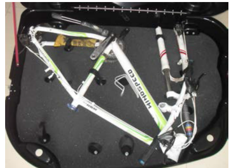
6. Bike disassembled and set aside