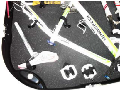
10. Refer of fixing the pedal and seat