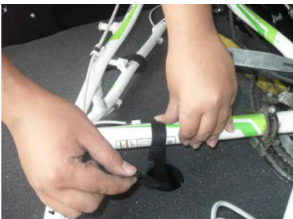
6. Fixed with straps