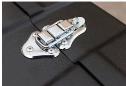
14. Lock all