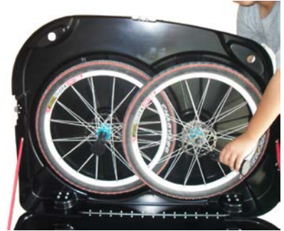
3. Fix the wheels with QR & support rods