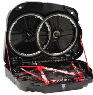
11. All parts fixed well