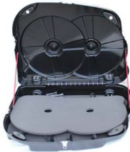
2. Take out the middle foam