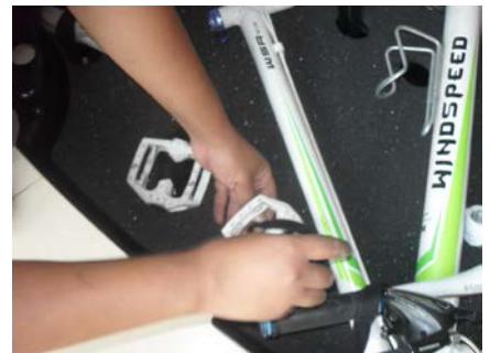
9. Fix pedal and seat