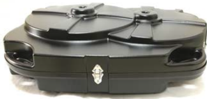
13. Pull down upper shell