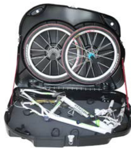
5. Refer of wheels on compartment