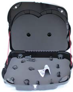
1. Refer of opening bike box