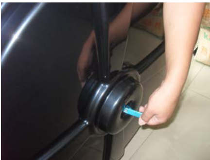
4. Tighten up the QR