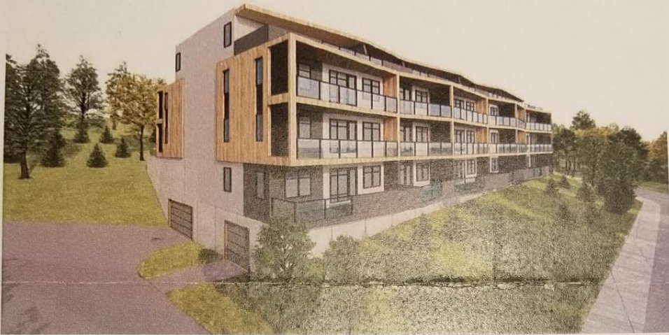
Figure 1 - Rendering of building facing south (front of building).