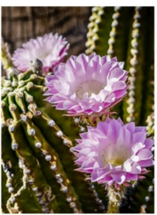
While the weather is still nice, get out there and enjoy it.