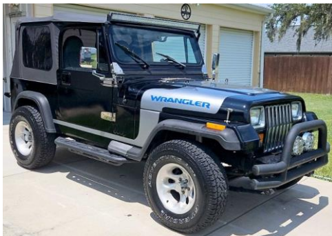
'90 Jeep Wrangler