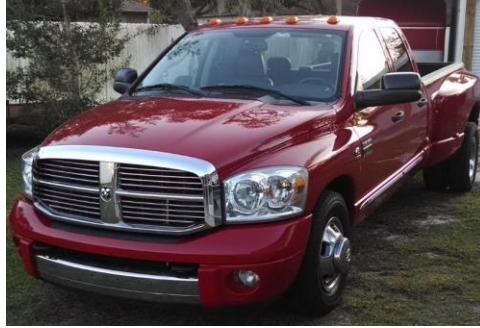
'07 Dodge 3500

Great rides Ken & Shellie! Looking forward to meeting you!