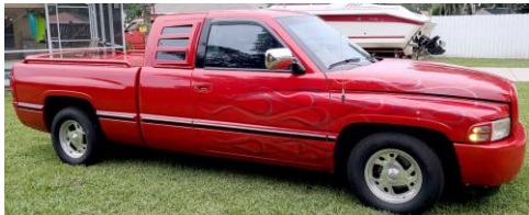
'95 Ram 1500 Sport