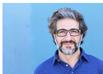
If You Can Qualify for Any Credit Card, These Are the