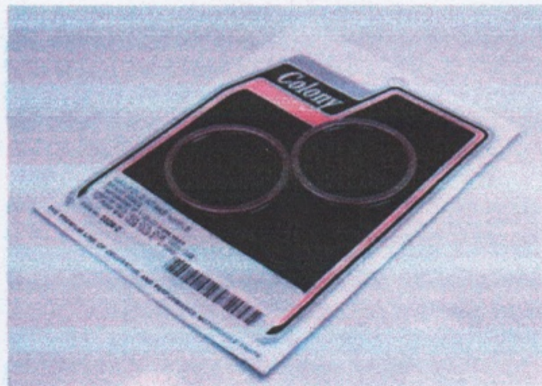
Part No. 3528-2 MANIFOLD INTAKE NIPPLE BRASS SEALS Reproduction of 1125-23 brass seals used on 1923-1924 DCA, DCB, 1925-1929 74" motor and 1928-1929 61" L motor. Retail: $6.50

Disclaimer: The listed retail price is our suggested retail price. Not responsible for typos.