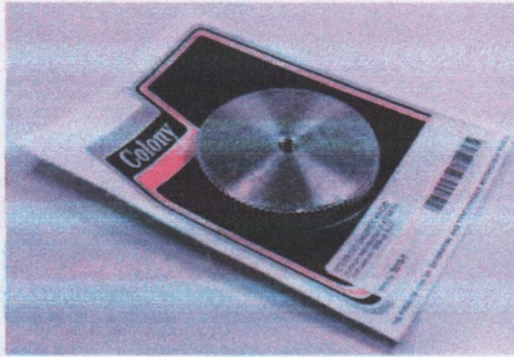
Part No. 3513-1 STEERING DAMPER KNOB Aluminum reproduction of 46746-59 knob used on 1959-up XLCH. Retail: $25.00