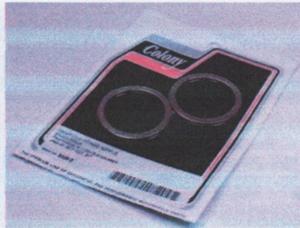
Part No. 3526-2 MANIFOLD INTAKE NIPPLE BRASS SEALS Reproduction of 1125-15 brass seals used on 1917-1923 61". Retail: $6.00