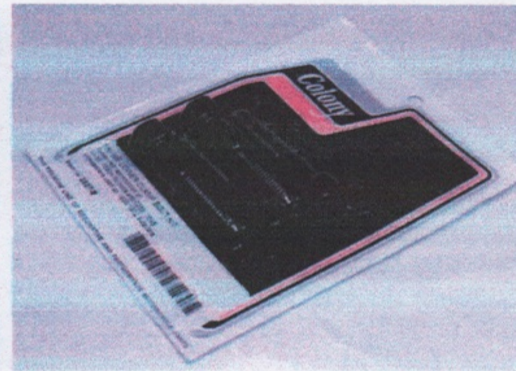
Part No. 3527-8 FRAME LOWER CLAMP BOLT KIT Parkerized reproduction of 14-30, 16804-30 bolts and 0265, 7055 lock washers used on 1936-1972 Sidecars. Retail: $21.99