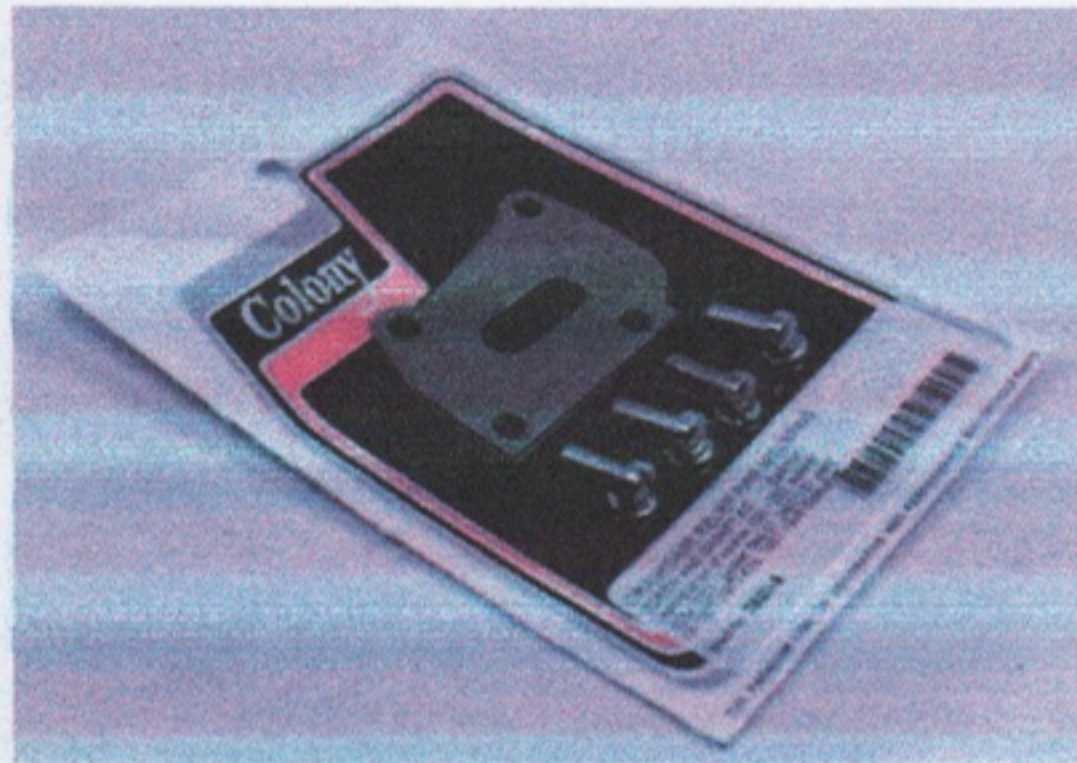
Part No. 3520-9 CRANKCASE RELIEF PIPE MOUNTING SCREW AND GASKET KIT reproduction of screws 036,1202, washer 0254,7021, gasket 544-37, 24921-37 used on 1937-1973 45's, 1937-1948 Sidevalve. Retail: $3.95