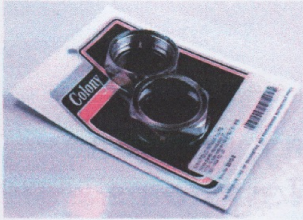
Part No. 3510-2 MANIFOLD INTAKE NUTS Nickel plated reproduction of 1115-15 nuts used on 1915-1927 61" and 1921-1924 FD, JD. Retail: $27.00