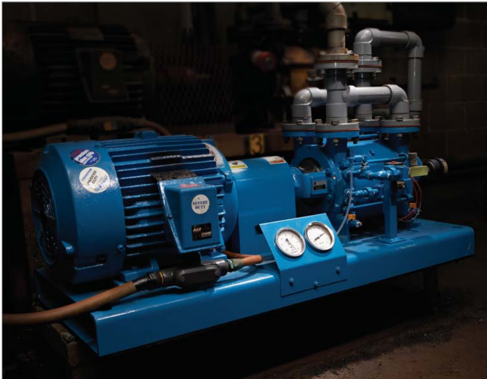
SIHI manufactured this corrosion resistant zirconium vacuum pump to withstand acid and temperature spikes in ATI Wah Chang’s challenging sponge-making process.

SIHI also simplified the pump in the process. “Typically when we get into these types of special metallurgy and special designs, we steer away from that two-stage design due to the complexities of the liquid ring vacuum pump design,” according to Karas. “We recommend a single-stage design, which