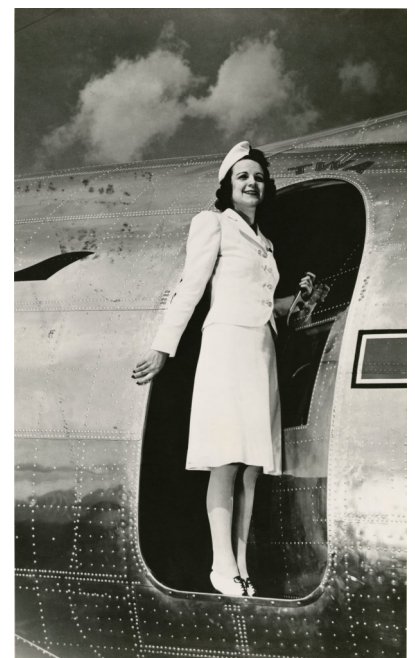
Petty Girl Summer 1939