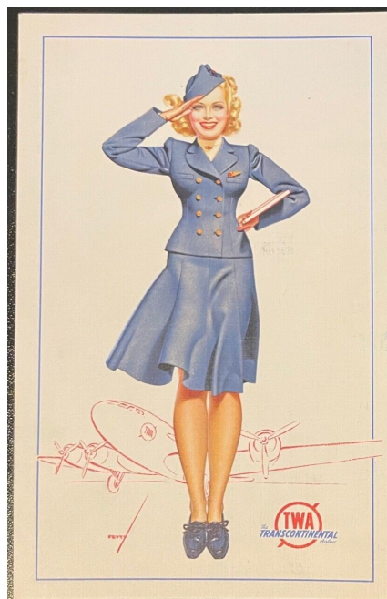
Petty Girl Winter 1939