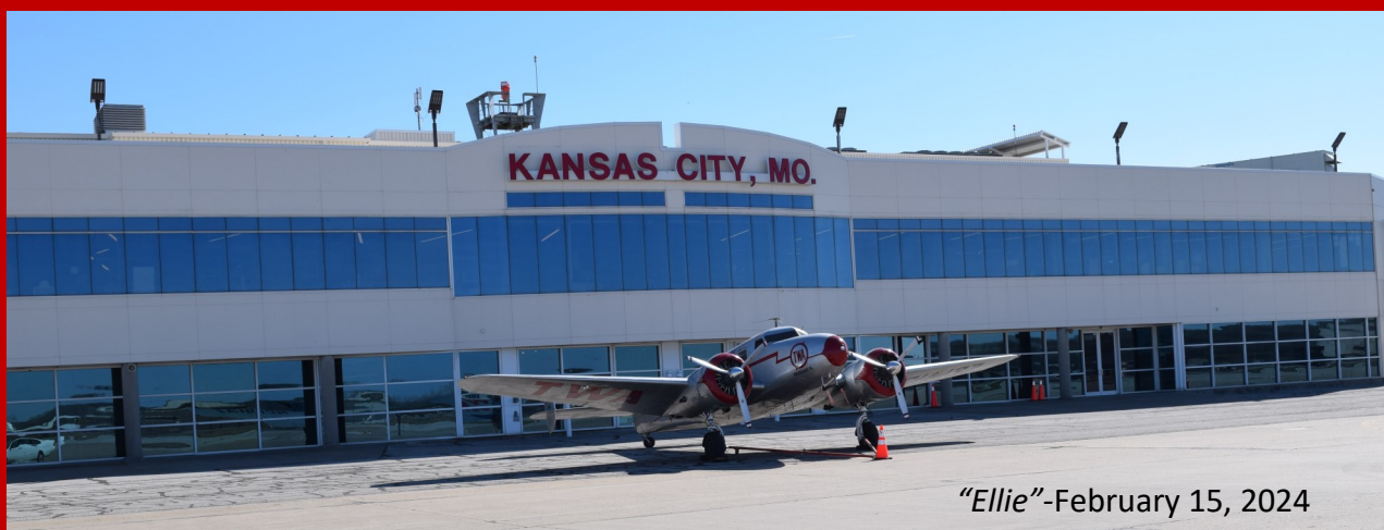
"Ellie" -February 15, 2024