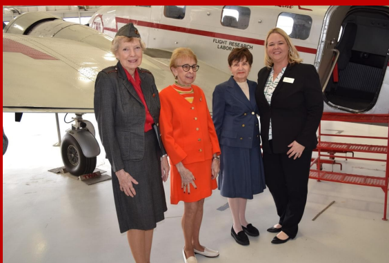
And we LOVED having the Clipped Wings ladies there!