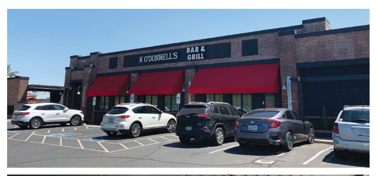
Scottsdale's ReVamp IT took on an installation in a sports bar that was undergoing both a remodeling and a dramatic technology expansion that included 71 TVs. They worked their magic with URC solutions, doing the install in overnight hours so as not to interrupt the business.