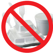
# 6 Plastics Styrofoam blocks (Not Accepted in Curbside Recycling Program. Accepted at the Westpark Recycling Center and ESC - South only)