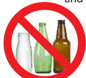
Glass (Not Accepted in Curbside Recycling Program. Accepted at Neighborhood Depository/ Recycling Centers and drop-off facilities.)