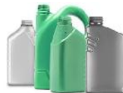
Used Motor Oil Do not place in recycling bin. Place on curb or bring to Westpark or ECSs.