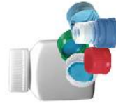
# 5 Plastics Yogurt containers, caps, straws and empty medicine bottles