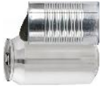
Aluminum & Tin Cans