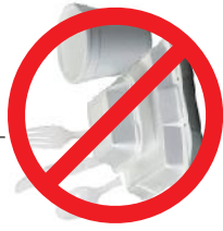
# 6 Plastics Styrofoam blocks (Not Accepted in Curbside Recycling Program. Accepted at the Westpark Recycling Center and ESC - South only)