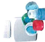
# 5 Plastics Yogurt containers, caps, straws and empty medicine bottles