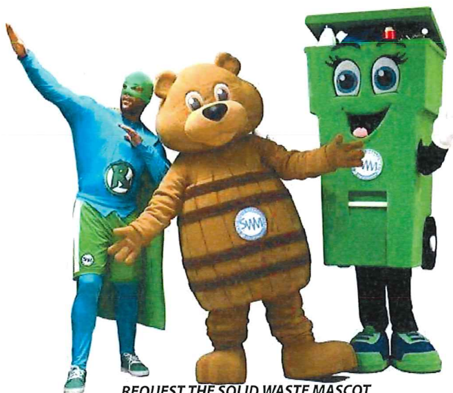
REQUEST THE SOLID WASTE MASCOT

To request the Solid Waste Management Department mascot or a Speaker from the SWMD please call 3-1-1, the City's Customer Service Hotline.