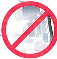
# 6 Plastics Styrofoam blocks

(Not Accepted in Curbside Recycling Program. Accepted at the Westpark Recycling Center and ESC - South only)