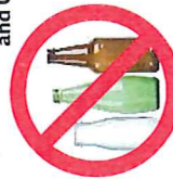
Glass (Not Accepted in Curbside Recycling Program. Accepted at Neighborhood Depository/Recycling Centers and drop-off facilities.)