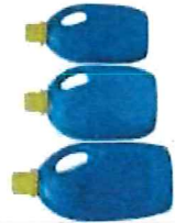
# 3 Plastics Detergent bottles, shampoo bottles