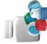
# 5 Plastics Yogurt containers, caps, straws and empty medicine bottles