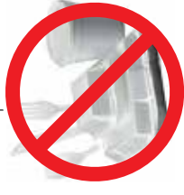
# 6 Plastics Styrofoam blocks (Not Accepted in Curbside Recycling Program. Accepted at the Westpark Recycling Center and ESC - South only)