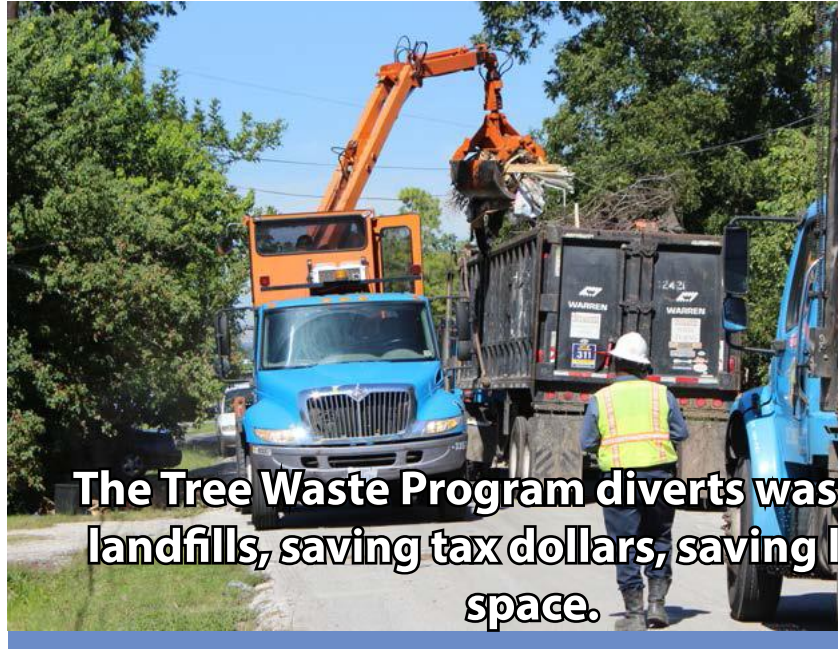
Tree Waste Recycling reduces loads headed to the landfill

The City will collect tree waste exclusively on odd months on the resident's current tree waste /junk waste collection day. "Tree waste" is defined as "clean wood waste", which consists of tree limbs, branches or stumps. Lumber, furniture and treated wood will not be accepted. On even months residents may set out their junk waste at the curb for city collection. "Junk waste" is used to describe items such as furniture, appliances and other bulky materials. These items should be placed adjacent to the front curb in a location easily accessible to the collection vehicle between the hours of 6:00 p.m. the Friday before, and 7:00 a.m. on the scheduled collection day. No more than eight cubic yards per residence will be collected on the scheduled tree waste/junk waste collection day. Of this amount, only a maximum of four cubic yards of building material (not to include roofing shingles, brick, plaster or concrete) generated by the resident in connection with the maintenance of the residential property may be collected by department personnel. A maximum of four (4) tires per month, per household may be placed curbside for collection. Sheet rock must be bagged. Appliances containing refrigerant must have a tag attached to them certifying that a qualified technician has removed the refrigerant. Materials should not be stacked under low overhead cabling,