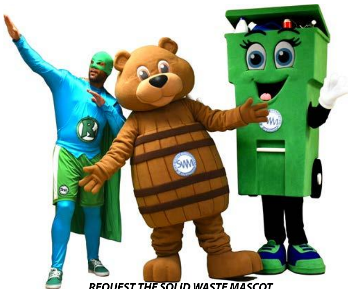
REQUEST THE SOLID WASTE MASCOT

To request the Solid Waste Management Department mascot or a Speaker from the SWMD please call 3-1-1, the City's Customer Service Hotline.