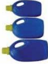
# 3 Plastics Detergent bottles, shampoo bottles