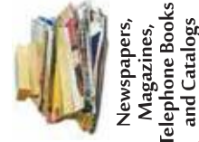
Newspapers, Magazines, Telephone Books and Catalogs