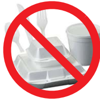
# 6 Plastics Styrofoam blocks (Not Accepted in Curbside Recycling Program. Accepted at the Westpark Recycling Center and ESC - South only)