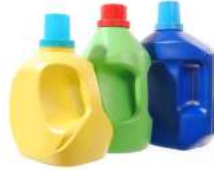
# 3 Plastics Detergent bottles shampoo bottles