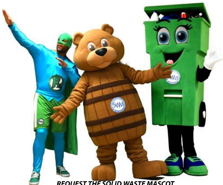
REQUEST THE SOLID WASTE MASCOT

To request the Solid Waste Management Department mascot or a Speaker from the SWMD please call 3-1-1, the City's Customer Service Hotline.