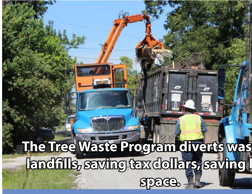
Tree Waste Recycling reduces loads headed to the landfill

The City will collect tree waste exclusively on odd months on the resident's current tree waste /junk waste collection day. "Tree waste" is defined as "clean wood waste", which consists of tree limbs, branches or stumps. Lumber, furniture and treated wood will not be accepted. On even months residents may set out their junk waste at the curb for city collection. "Junk waste" is used to describe items such as furniture, appliances and other bulky materials. These items should be placed adjacent to the front curb in a location easily accessible to the collection vehicle between the hours of 6:00 p.m. the Friday before, and 7:00 a.m. on the scheduled collection day. No more than eight cubic yards per residence will be collected on the scheduled tree waste/junk waste collection day. Of this amount, only a maximum of four cubic yards of building material (not to include roofing shingles, brick, plaster or concrete) generated by the resident in connection with the maintenance of the residential property may be collected by department personnel. A maximum of four (4) tires per month, per household may be placed curbside for collection. Sheet rock must be bagged. Appliances containing refrigerant must have a tag attached to them certifying that a qualified technician has removed the refrigerant. Materials should not be stacked under low overhead cabling,