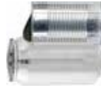
Aluminum & Tin Cans