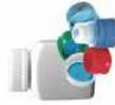
# 5 Plastics Yogurt containers, caps, straws and empty medicine bottles