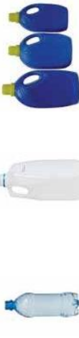
# 1 Plastics Soft drink and water bottles