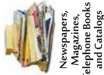
Newspapers, Magazines, Telephone Books and Catalogs