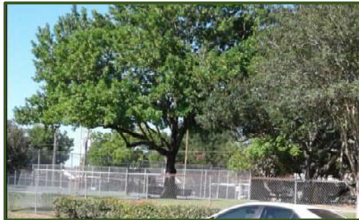
Trees at Kittybrook Park received much needed trims as well!