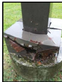
Light Pole at Ludington Park repaired