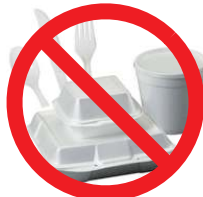
# 6 Plastics Styrofoam blocks (Not Accepted in Curbside Recycling Program. Accepted at the Westpark Recycling Center and ESC - South only)