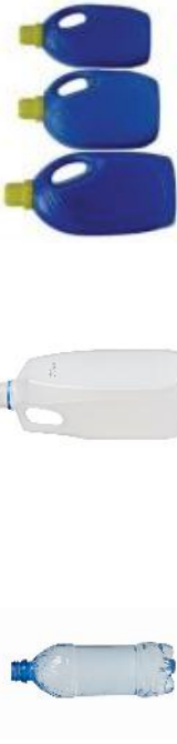
# 1 Plastics Soft drink and water bottles