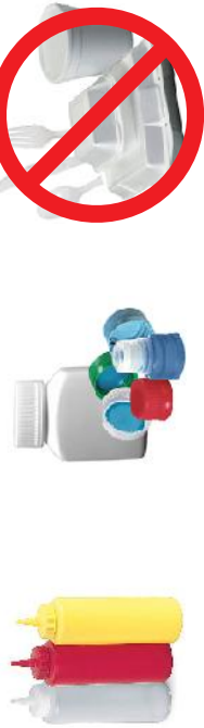
# 4 Plastics Condiment bottles