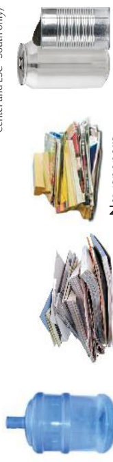
# 7 Plastic Large water bottles