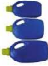
# 3 Plastics Detergent bottles, shampoo bottles