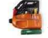
Used Motor Oil* *Accepted in the Curbside Recycling Program, depositories, ESCs and Westpark.