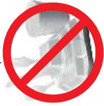
# 6 Plastics Styrofoam blocks (Not Accepted in Curbside Recycling Program. Accepted at the Westpark Recycling Center and ESC - South only)