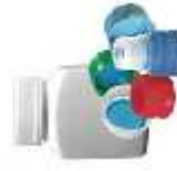
# 5 Plastics Yogurt containers, caps, straws and empty medicine bottles