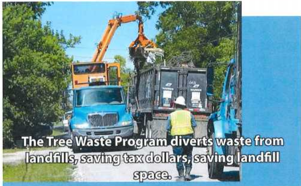
Tree Waste Recycling reduces loads headed to the landfill

The City will collect tree waste exclusively on odd months on the resident's current tree waste /junk waste collection day. "Tree waste" is defined as "clean wood waste", which consists of tree limbs, branches or stumps. Lumber, furniture and treated wood will not be accepted. On even months residents may set out their junk waste at the curb for city collection. "Junk waste" is used to describe items such as furniture, appliances and other bulky materials. These items should be placed adjacent to the front curb in a location easily accessible to the collection vehicle between the hours of 6:00 p.m. the Friday before, and 7:00 a.m. on the scheduled collection day. No more than eight cubic yards per residence will be collected on the scheduled tree waste/junk waste collection day. Of this amount, only a maximum of four cubic yards of building material (not to include roofing shingles, brick, plaster or concrete) generated by the resident in connection with the maintenance of the residential property may be collected by department personnel. A maximum of four (4) tires per month, per household may be placed curbside for collection. Sheet rock must be bagged. Appliances containing refrigerant must have a tag attached to them certifying that a qualified technician has removed the refrigerant. Materials should not be stacked under low overhead cabling,