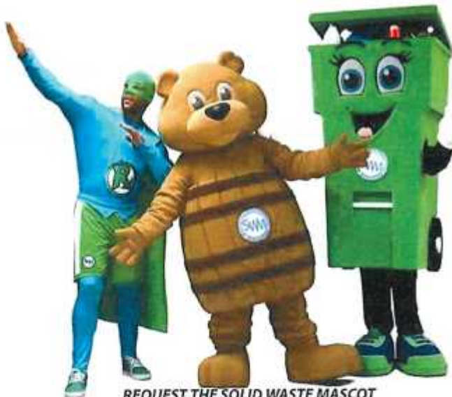
REQUEST THE SOLID WASTE MASCOT

To request the Solid Waste Management Department mascot or a Speaker from the SWMD please call 3-1-1, the City's Customer Service Hotline.