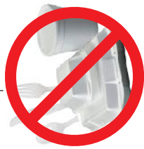
# 6 Plastics Styrofoam blocks (Not Accepted in Curbside Recycling Program. Accepted at the Westpark Recycling Center and ESC - South only)