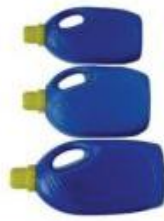
# 3 Plastics Detergent bottles, shampoo bottles