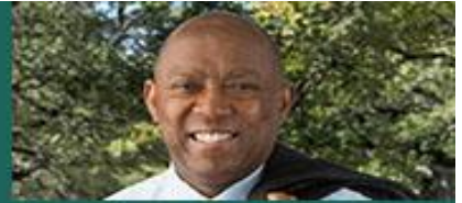
Sylvester Turner, Mayor