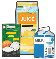
Food and Beverage Cartons empty and rinse