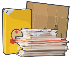
Mixed Paper, Mail, Newspaper, Magazines, and Flattened, Clean Cardboard