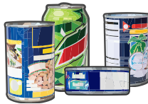
Aluminum and Steel Cans empty and rinse