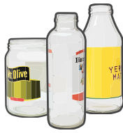
Bottles and Jars empty and rinse