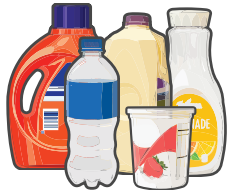
Kitchen, Laundry, Bath: Bottles and Containers empty and rinse