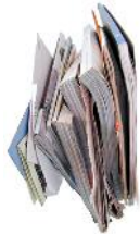
Mail, Envelopes, and Paper