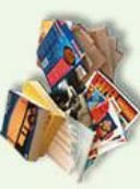
Newspapers, Magazines, Telephone Books and Catalogs