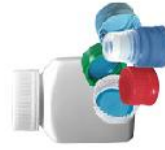
# 5 Plastics Yogurt containers, caps, straws and empty medicine bottles