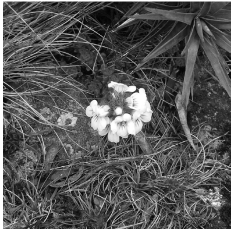
Euphrasia gibbsiae subsp. Wellingtonensis

A survey of the rare Mt Wellington eyebright, Euphrasia gibbsiae subsp. Wellingtonensis , was carried out by the Threatened Species Section of DPIIWE and Threatened Plants Tasmania (Wildcare Inc.). This species is a small herb known only from kunanyi / Mount Wellington (see photo). Its preferred habitat is the string bogs between the summit and Thark Ridge. About 600 plants of the species were detected during the survey with the total population likely to be in the thousands.