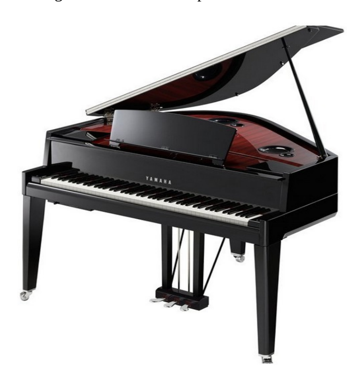
Figure 1: Yamaha N3X Grand Hybrid Piano

We have all been watching as our daily lives increasingly depend on support from electronic devices that in turn are based on digital computing technologies. For example, we use computers at home for business and social purposes, we use cell phones extensively, and our cars are dependent on multiple embedded computers. So we are not surprised that technology has invaded the piano world. Since 2009 a new type of piano, the Hybrid Piano , has been sold in piano stores, along with the traditional acoustic piano and the simpler electronic and digital pianos and keyboards. Figure 1 shows an example of one.