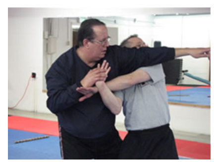
Even an "old grandfather" gets to play, "He went that away"!