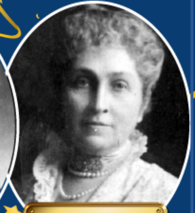
PHOEBE APPERSON HEARST