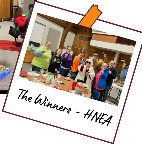
The Winners - HNEA