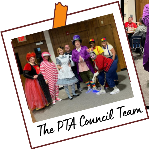
The PTA Council Team