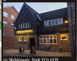
61 Skeldergate, York YO1 6DS