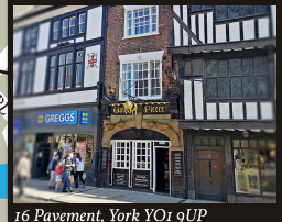
16 Pavement, York YO1 9UP