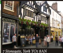
7 Stonegate, York YO1 8AN