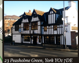
23 Peasholme Green, York YO1 7DE