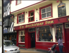
47 Goodramgate, York YO1 7LS