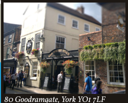
80 Goodramgate, York YO1 7LF