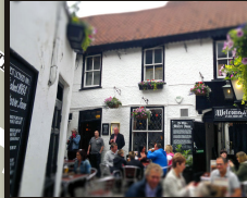
40 Stonegate, York YO1 8AS