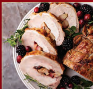
CHRISTMAS DAY LUNCH