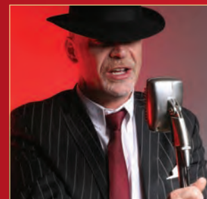
NEW YEAR'S EVE BALL