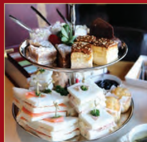
FESTIVE AFTERNOON TEA