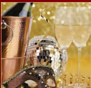
FESTIVE PARTY NIGHTS