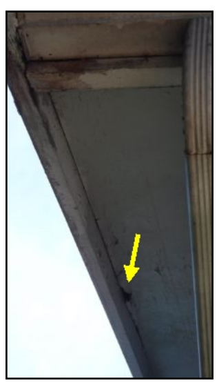
Gable overhang on north end has minor moisture damage