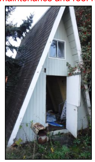
A frame outbuilding in need of maintenance