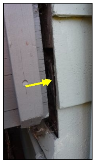
Siding has been cut away and left unflashed for deck attachment