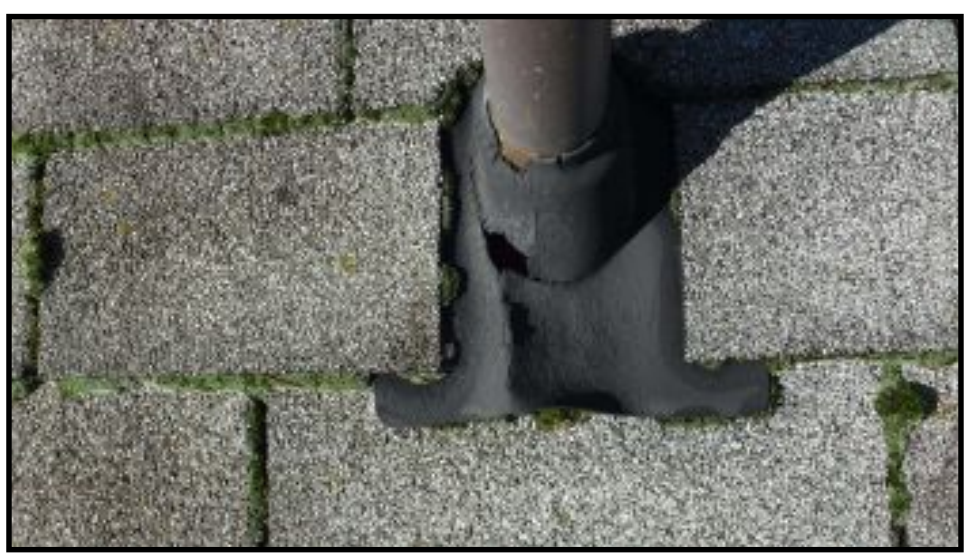
Plumbing vent boots are in need of replacement