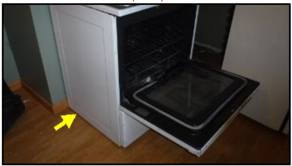
Free standing oven is missing anti tip clip

• SAFETY CONCERN: Free standing range missing anti-tip bracket/device, recommend install anti tip clamp