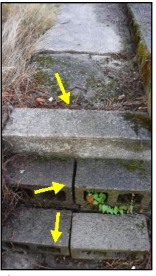
Walkway & brick steps are a trip hazard