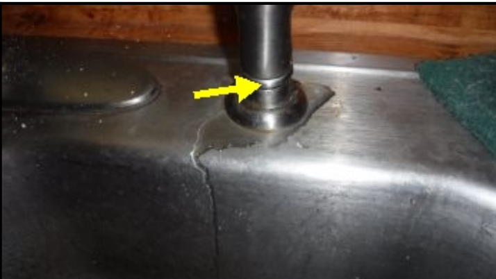
Spray wand leaks at hose connection