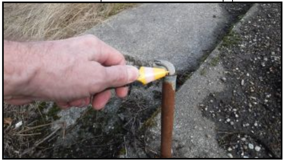
Exposed energized electrical line is a hazard