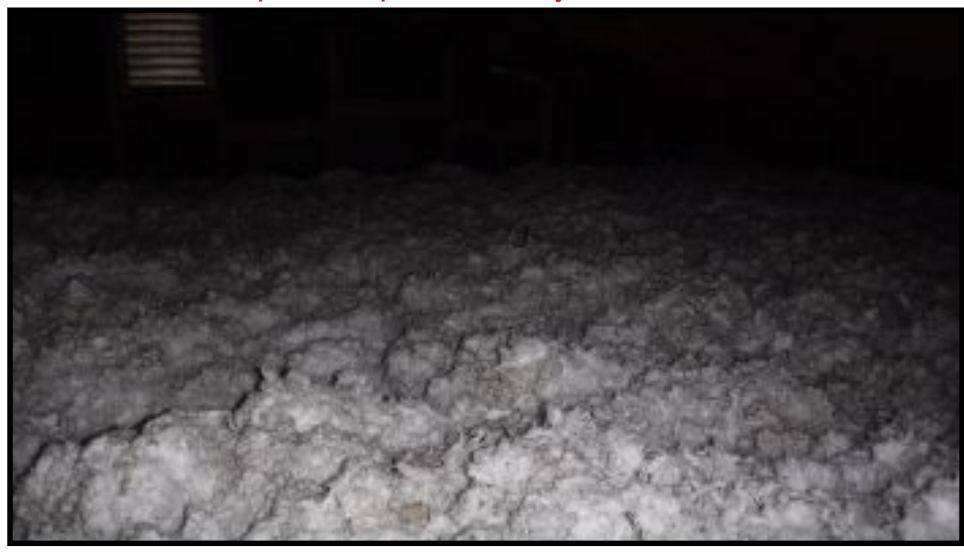
Attic insulation is in good condition