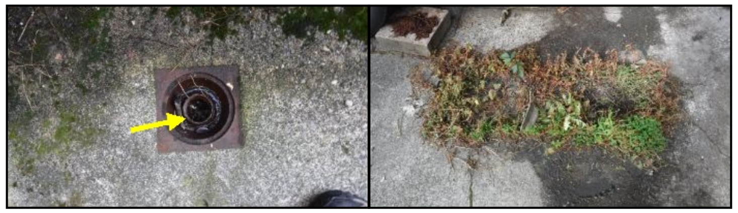
French drain is clogged with debris