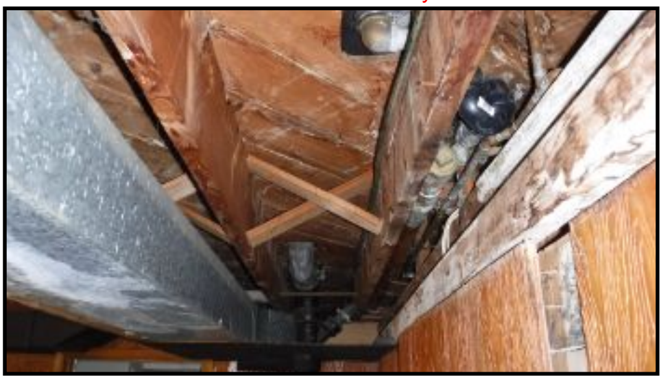
Garage firewall is missing, smoke & fire hazard exists

• An area of ceiling near the garage is unsealed to smoke & fire. In the event of a garage fire, some smoke could find it's way into the living area at this opening and gain access to the living area. This can be addressed by simply by installing finish ceiling material at this location. It is recommended that this area be sealed for fire & smoke safety