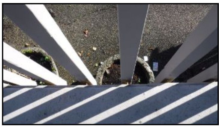
Deck ballusters are not secure