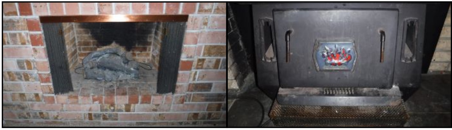
Brick fireplace is in good condition

burning fireplaces. See www.ecy.wa.gov for further reference • The fireplace insert is in need of cleaning and ash removal