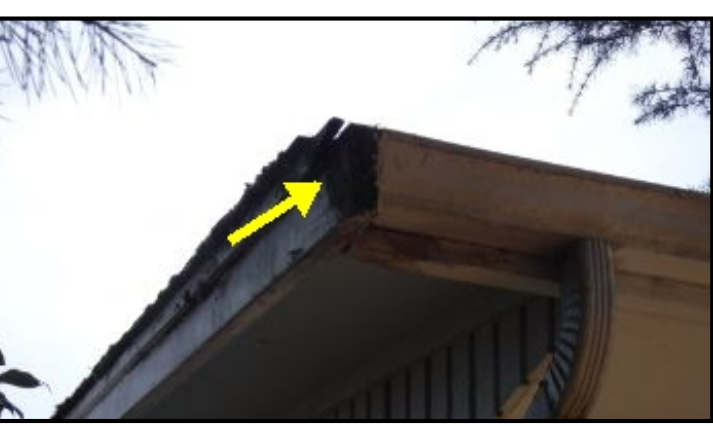
Beam is missing flashing