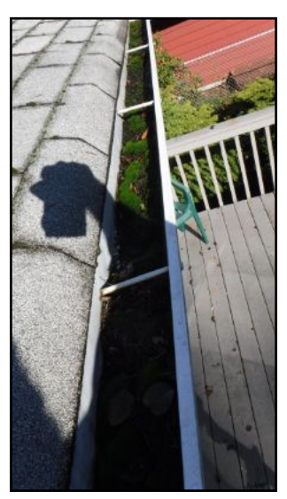
Gutters are clogged with debris