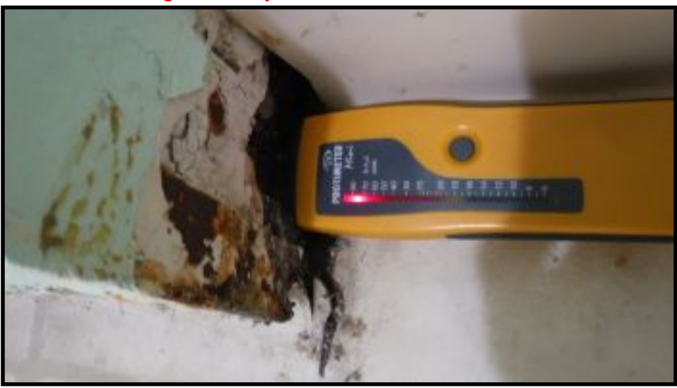
High moisture content at basement wall