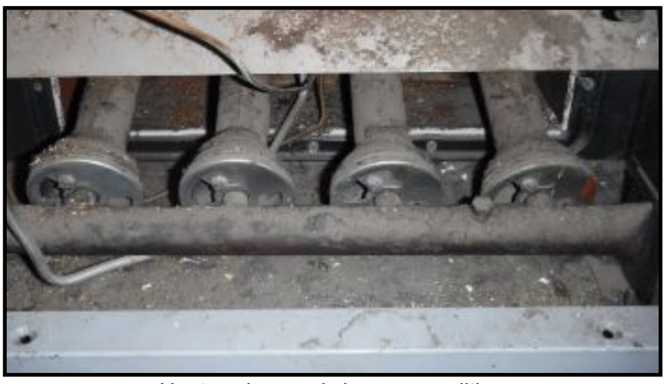
Heat exchanger is in poor condition