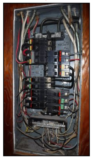
Stab Lok breakers are obsolete

• Breakers are loose in the panel, recommend replace panel and breakers