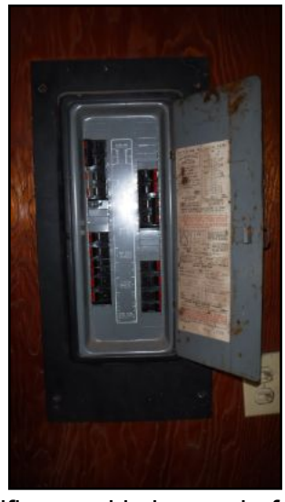
Federal Pacific panel is in need of replacement