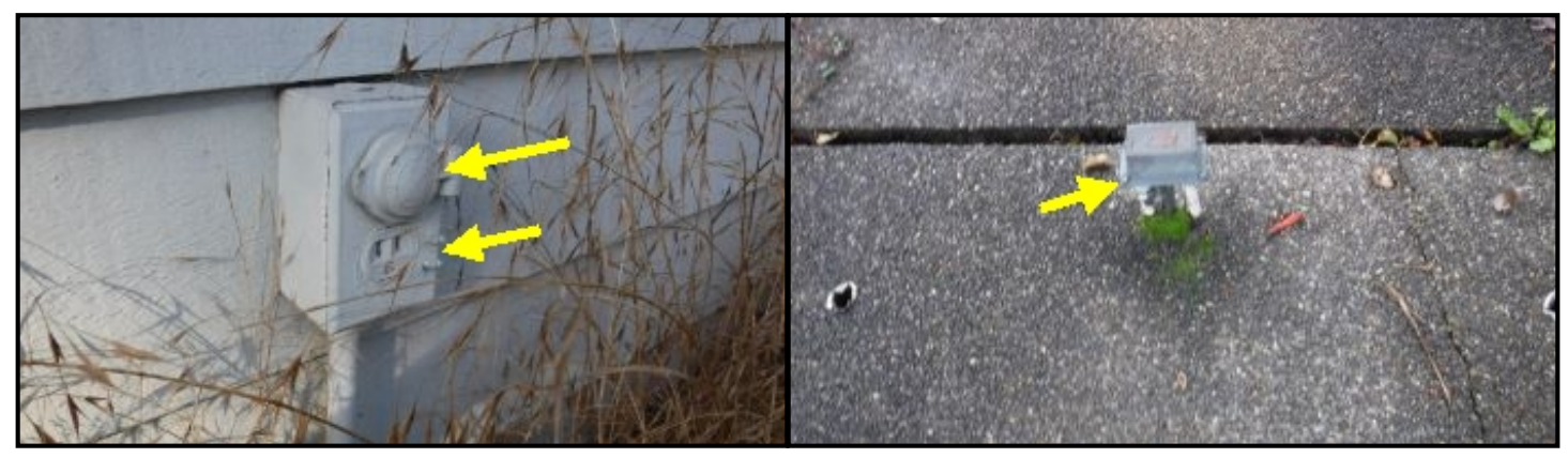
Exterior outlet covers in need of repair