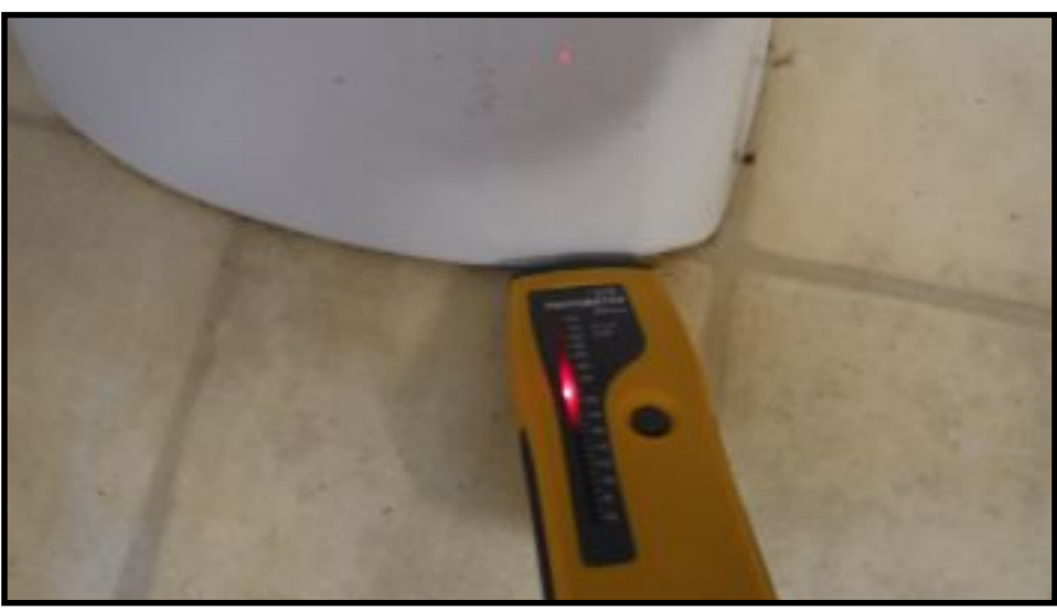
Basement toilet may be leaking at wax seal