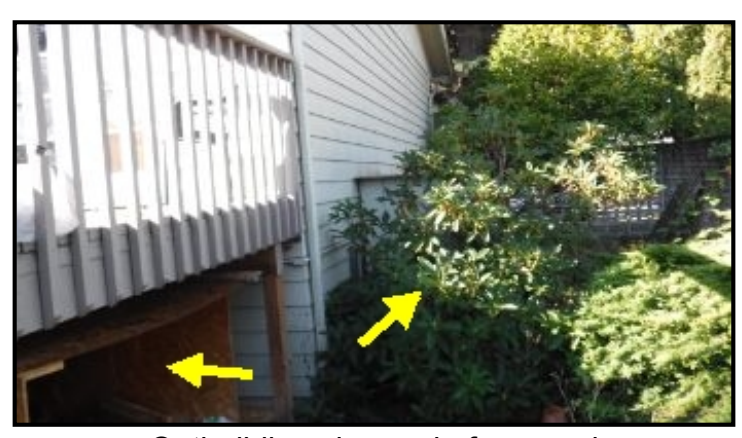
Outbuildings in need of removal