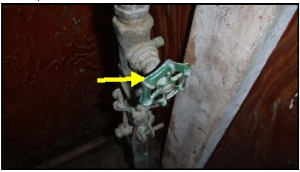
Main shutoff valve is in need of replacement or repair for leaks