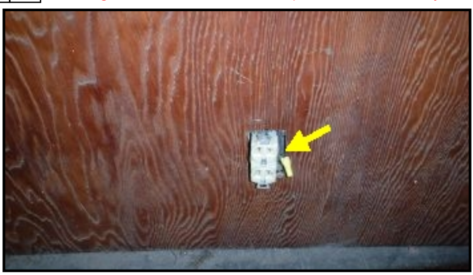
Outlets missing outlet covers

• Missing outlet covers should be replaced wherever they are found