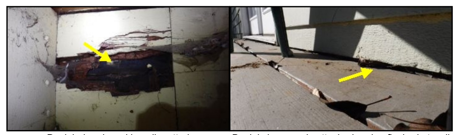
Deck ledger board heavily rotted