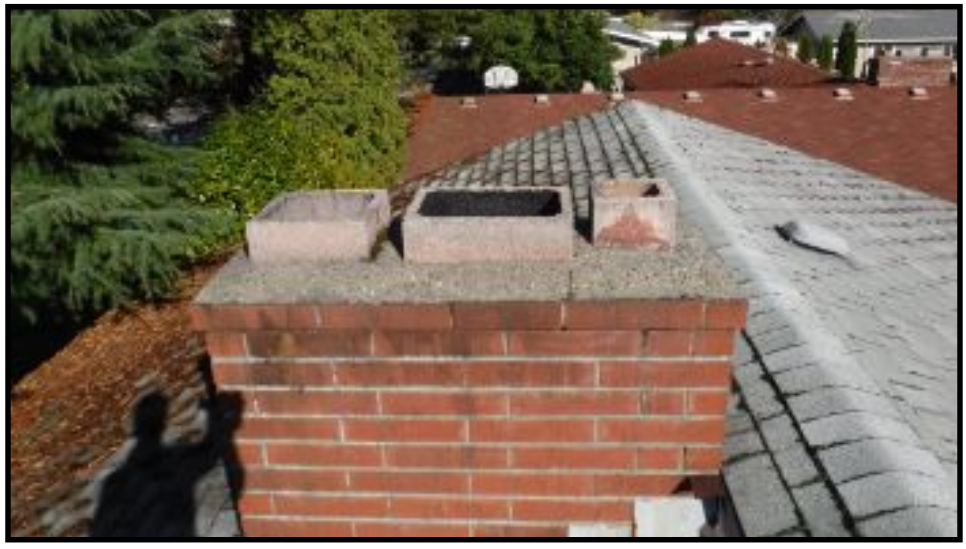
Chimney in need of wildlife caps, B-vent flue lining