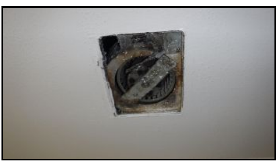
Master bath exhaust fan is inoperable