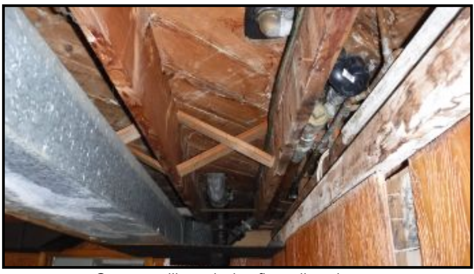
Garage ceiling missing firewall enclosure