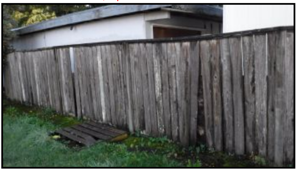
South fence in need of rot repair

• Areas of the wooden fence are in need of maintenance for broken boards or rot at the base, repair as desired