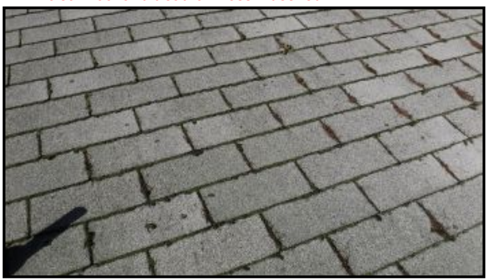
Roof is in need of cleaning for moss buildup