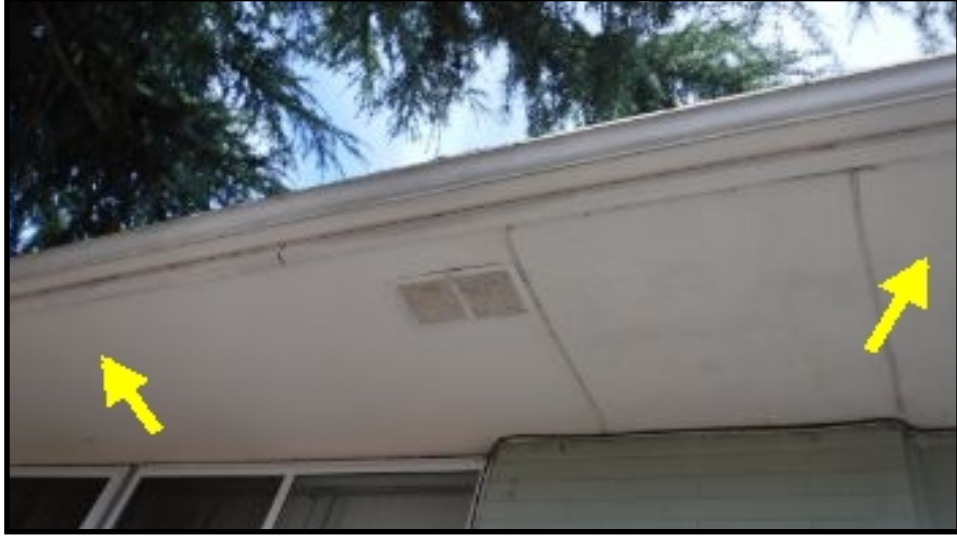
Roof is in need of additional soffit vents

• It is advisable to add ventilation openings to the enclosed soffit to maximize ventilation performance of this attic