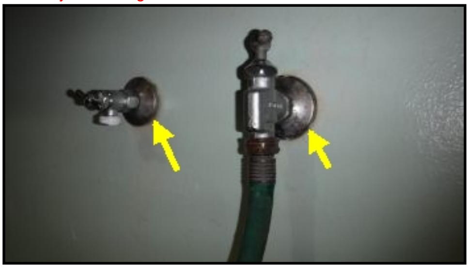
Laundry plumbing valves may be leaking inside wall

• Both laundry plumbing fixtures appear to be leaking at the time of the inspection, recommend replace plumbing outlets in laundry and repair drywall damage from moisture in the wall