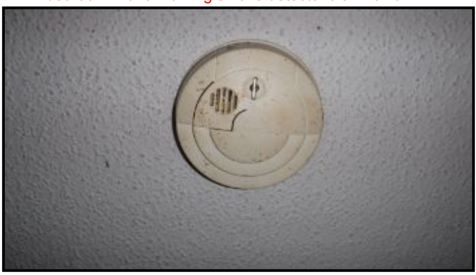
Smoke alarm inoperable