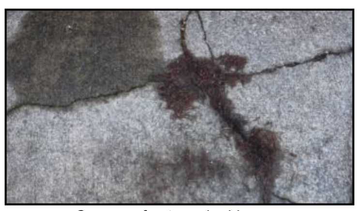
Common fractures in driveway