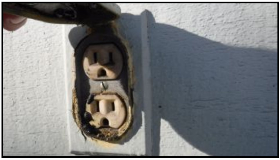
Exterior outlets in are not GFCI protected