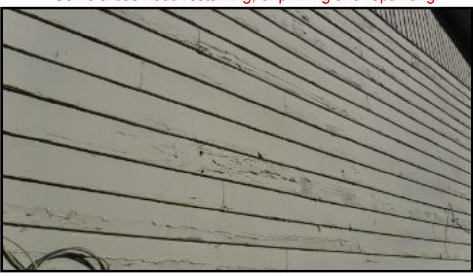
South end wall in need of prep & paint

Some areas need restaining, or priming and repainting.