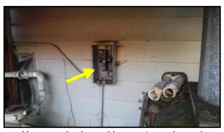
Uncovered subpanel is an extreme hazard