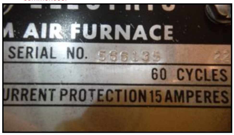
Furnace age could not be determined

• The furnace is in a condition and of an age that the inspector considers it to be highly hazardous to the occupants of the home. It is recommended that the furnace not be used, and replaced before any occupation of the home commences.