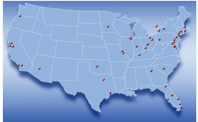
Ricoh's National Document Processing Centers