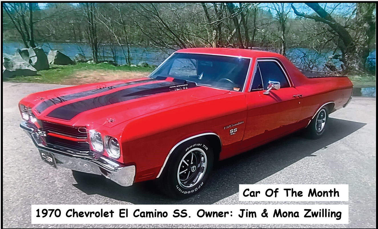
Car Of The Month